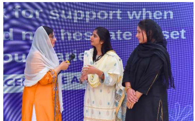
An interactive question and answer session with team members