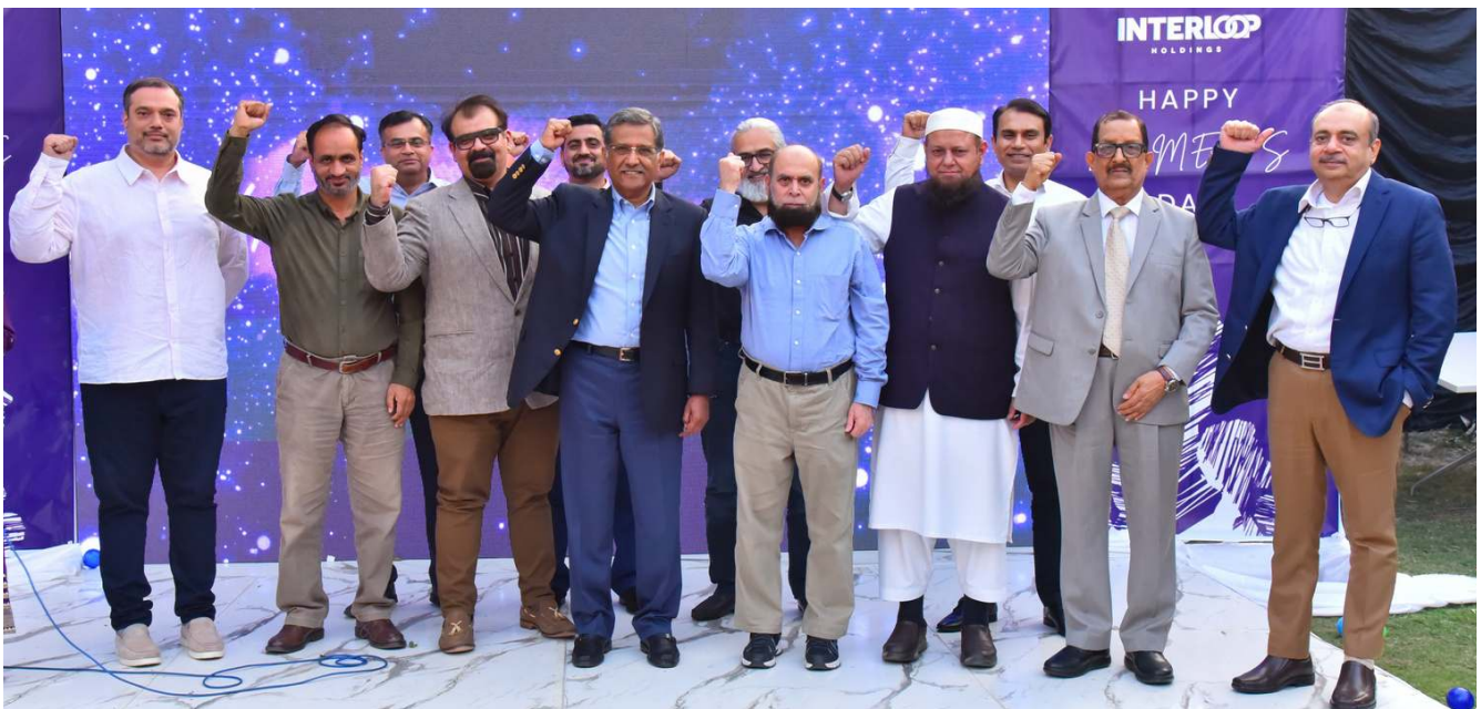
Top Leadership pledging "Accelerate Action" on the International Women's Day