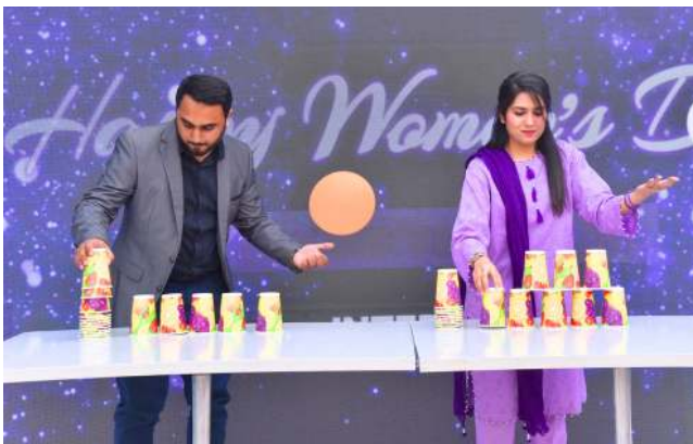
Through play, team members from Interloop Holdings participate in a game

In a moment of unity, the leadership team of Interloop Holdings stood together, symbolizing their collective support for the advancement of women and equal opportunities for all.