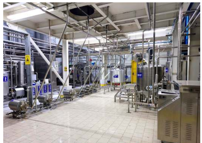
IRC Whey Powder Plant

The new plant will contribute to supplying high-quality whey powder to customers in Pakistan and beyond, addressing the escalating demand for dairy products. This facility marks a significant leap in IRC's development and further establishes its reputation as a prominent dairy processor.