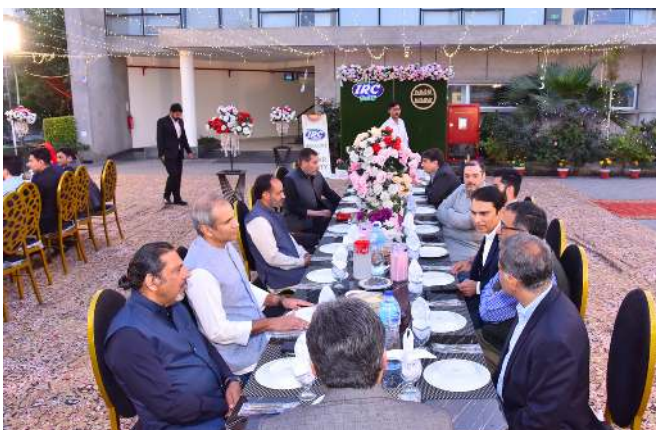
Senior Leadership from IRC, ILH, and subsidiaries enjoying an Iftar dinner at the IRC plant

Adding to the sense of unity and celebration, an Iftar dinner was held at the IRC plant, bringing together management and team members from Interloop Holdings' corporate office and its subsidiaries. This gathering provided a valuable opportunity to connect and strengthen the collective bond driving IRC Dairy Products' promising future.