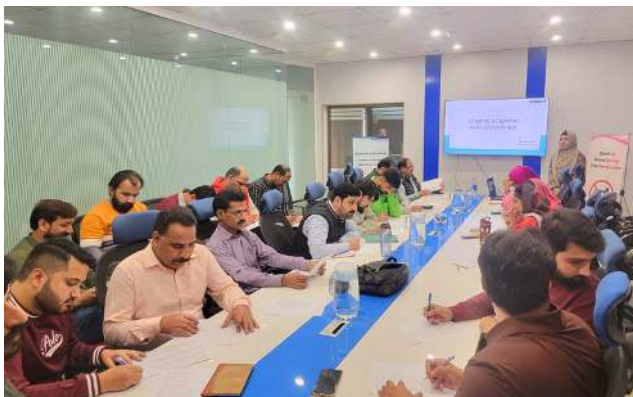
Participants actively engaged during the session

Interloop Holdings Private Limited recently conducted a dedicated training session at Socks & Socks facility. The session focused on recognizing, preventing, and effectively addressing workplace harassment to ensure a dignified and respectful workplace. This initiative aims to demonstrate Interloop Holdings' ongoing commitment to a safe and inclusive environment for all its employees.