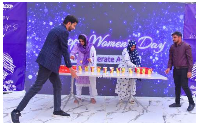
Team members from Interloop Holdings and its subsidiaries during a game activity