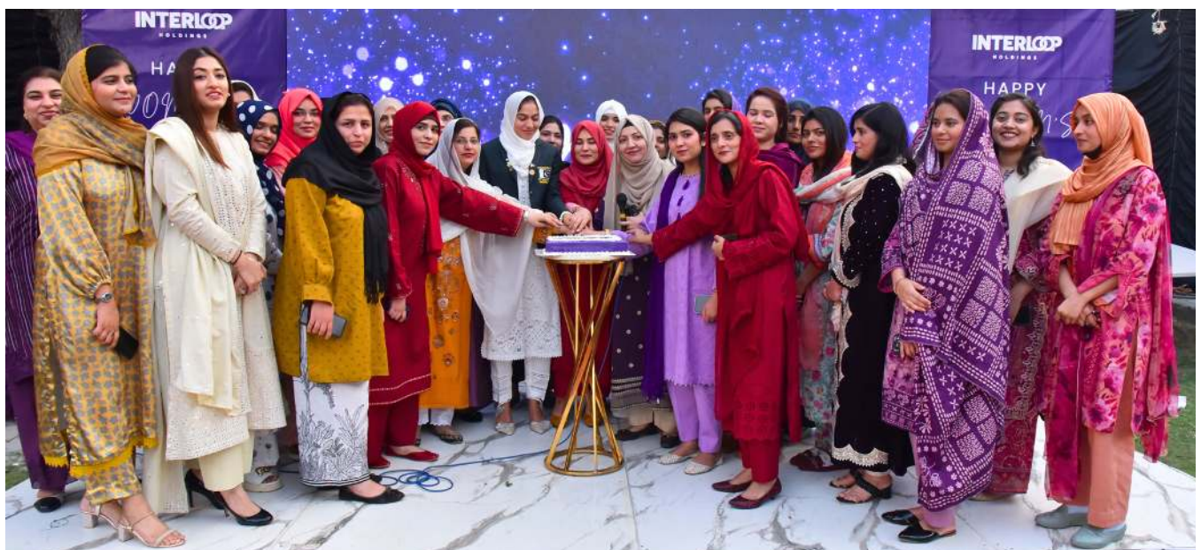
Sweetening up Women's Day with cake cutting