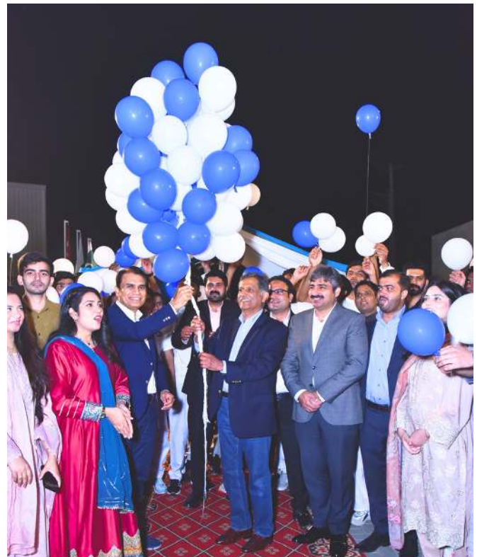
IRC team members sharing a joyful moment of releasing balloons