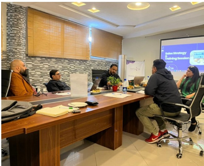
Team's strategic discussions underway