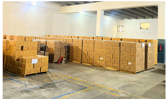
Momentum Logistics Warehouse

Momentum Logistics has marked a major milestone by partnering with Marico Middle East as the exclusive distributor of their flagship product lines in Pakistan. This exciting collaboration introduces renowned brands such as Parachute Pure Coconut Oil, Parachute Advanced Shampoo, and Livon Hair Serum to the local market.