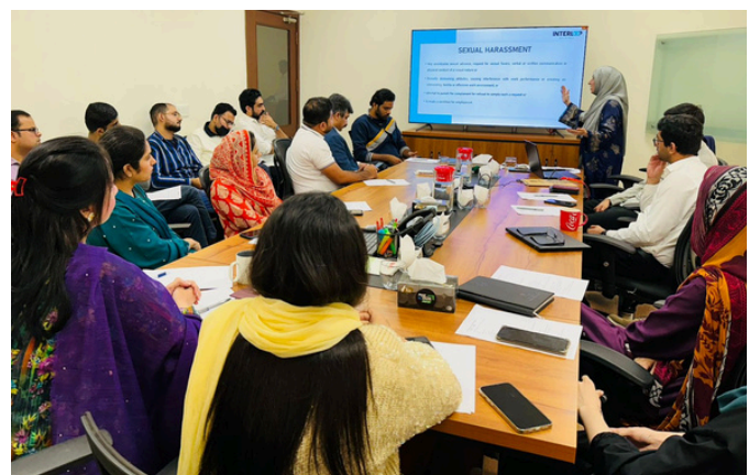
IRC team during the session

This initiative highlights Interloop Holdings' dedication to creating inclusive, safe, and professional environment across all its entities. With more training and activities planned, the campaign continues to support dignity and respect in the workplace.