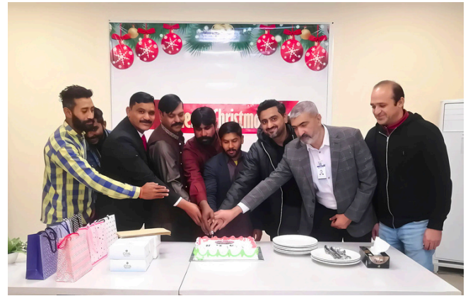
The team gathers for a cake-cutting moment

Interloop Holdings celebrated Christmas with a delightful cake-cutting ceremony, promoting togetherness and festive cheer. The Christian community received thoughtful giveaways, and a heartfelt prayer led by a team member highlighted the spirit of gratitude and hope. The event was marked by laughter, conversations, and shared joy, showcasing the organization's commitment to inclusivity and meaningful connections.