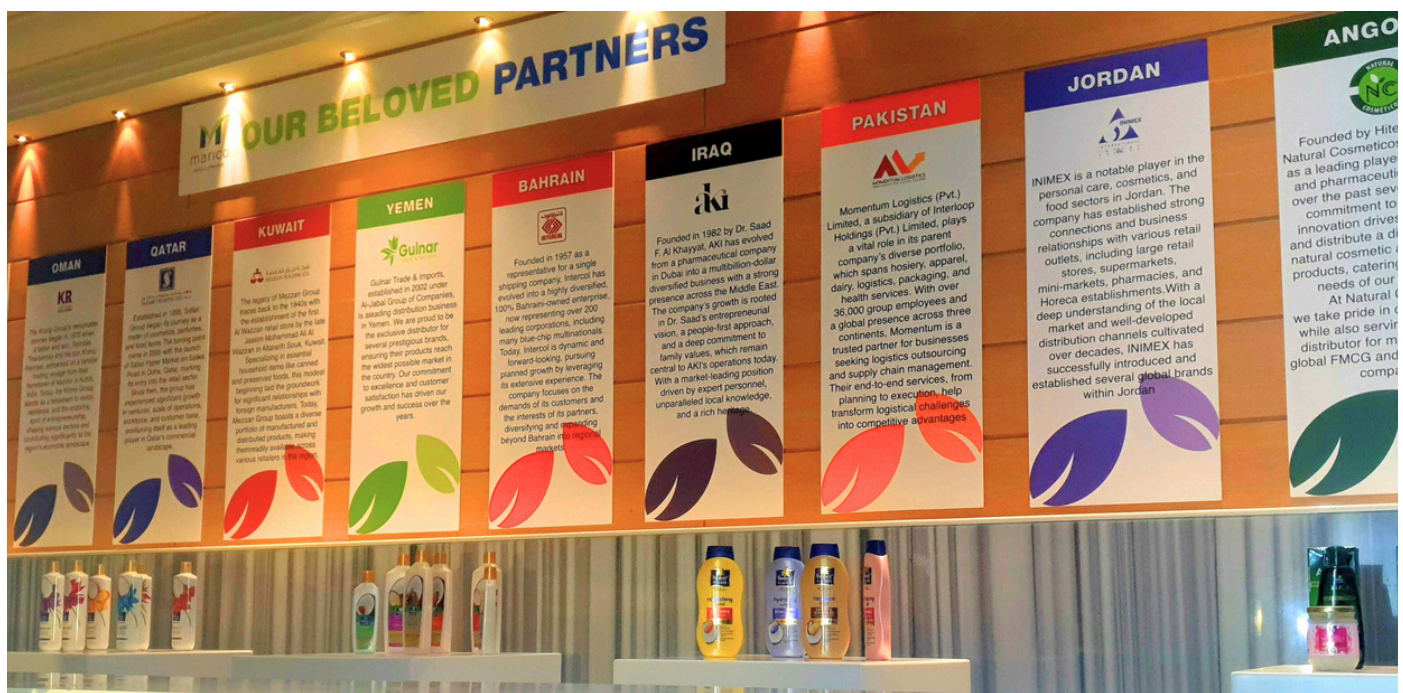
Momentum Logistics secures exclusive distribution rights for Marico Middle East

Marico Middle East, a leader in categories like hair care, skin care, edible oils, male grooming, and fabric care, brings its globally trusted products to Pakistan through this partnership.