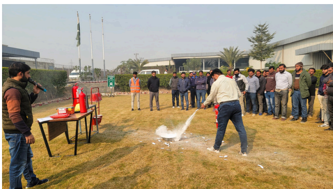
Fire Safety Instructor providing essential guidance