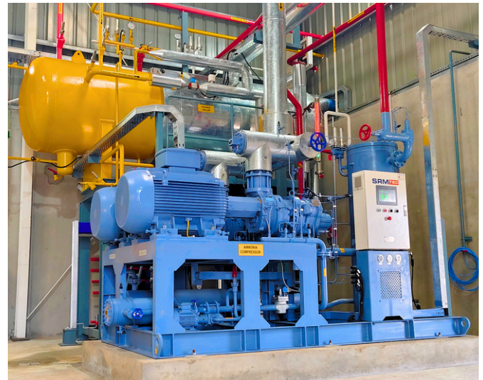
Ammonia Chiller installed at IRC

The Ammonia Chiller represents more than just technological advancement; it reinforces IRC's strategic commitment to performance, quality, and continuous improvement in the dynamic dairy products industry.