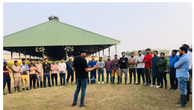
Key insights being shared in the session

Helmets were made mandatory for all riders, and employees were encouraged to consider bike safety courses for enhanced skills.