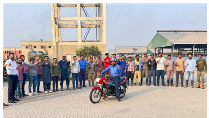
Essential measures in action