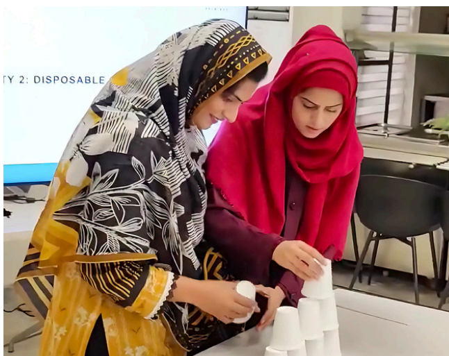
ILH team members participating in an activity

Interloop Holdings transformed the workplace into a vibrant hub of growth and fun with a series of engaging learning sessions held in December 2024. These sessions were designed not only to enhance essential soft skills but also to create an environment that encouraged team bonding and personal development.