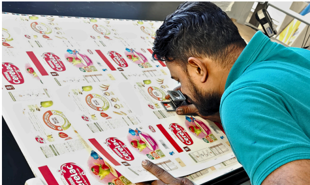
QA team's meticulous focus on color inspection

This collaboration highlights Printkraft's ability to deliver tailored solutions that align with the vision of its partners. By combining functionality and aesthetic appeal, Printkraft ensures packaging that meets the highest standards of quality and consumer expectations.