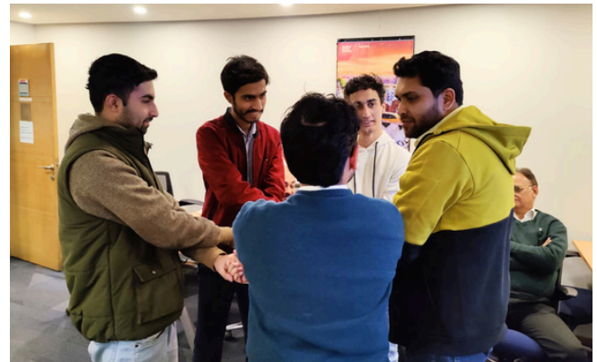
OD's team participation in session activity

Interactive activities and open discussions provided a platform for employees to engage, share insights, and practice positive behaviors in real-world scenarios.