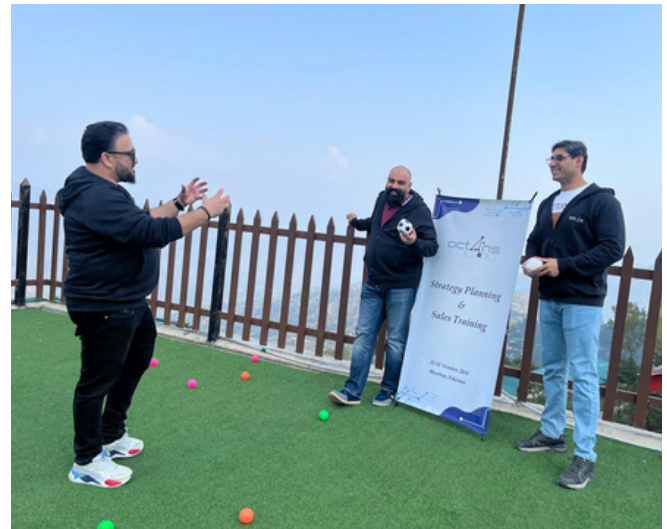
OD's sales team exchanging insights

The retreat offered engaging team-building activities that sparked creativity and teamwork, along with collaborative sessions to share ideas and address challenges. These moments allowed the team to reflect on past achievements and strategize for future planning.