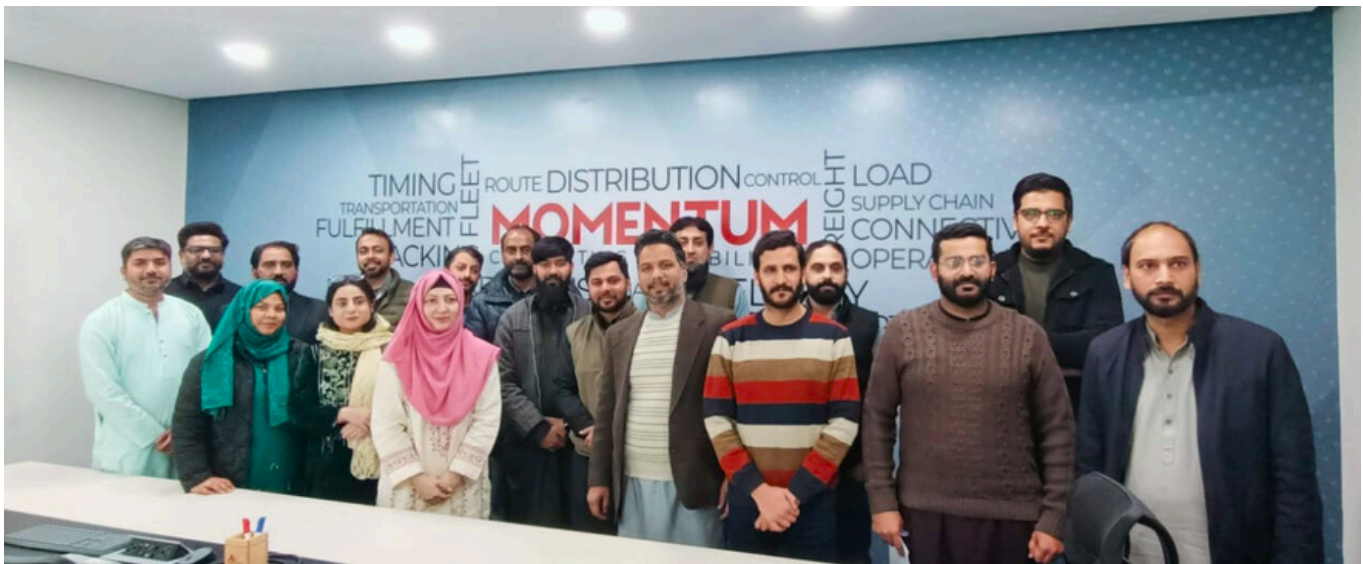
A group photo with ML's team after the session

These sessions offered practical guidance on recognizing, addressing, and preventing workplace harassment while fostering a culture of mutual respect and accountability.