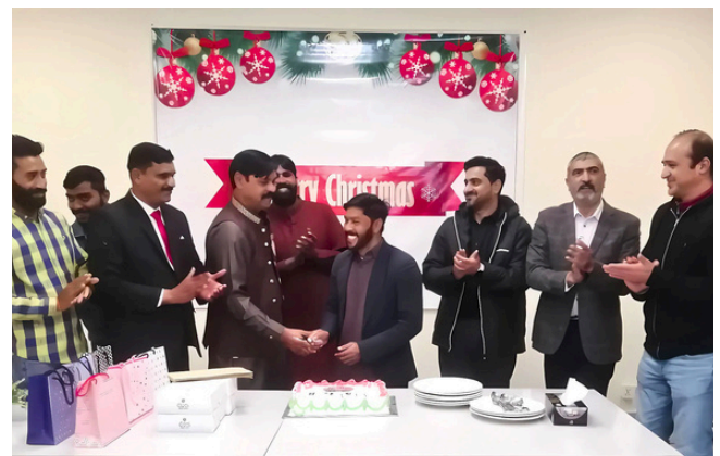
ILH team sharing moments of happiness