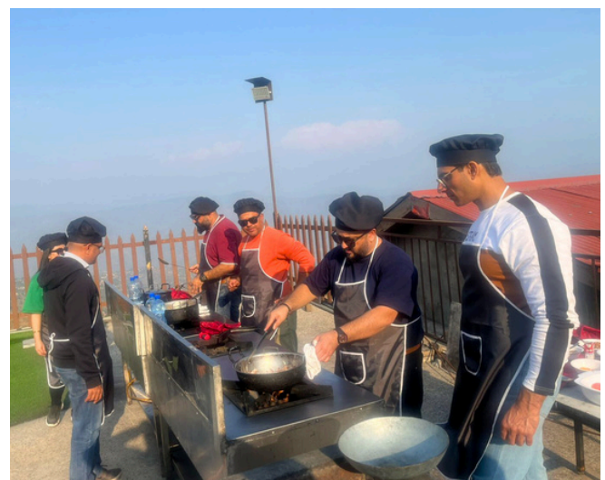
Sizzling moments of joy and flavor

With renewed enthusiasm and determination, the team is even more ready to tackle the challenges ahead, making the retreat a valuable step toward a bright and successful future.