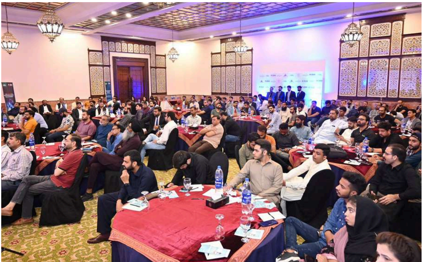
IT Leaders and audience in the hall