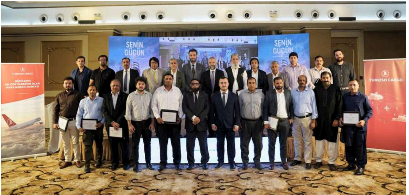
Momentum Logistics alongside Turkish Airline team after receiving the performance award

This recognition highlights Momentum Logistics' dedication to excellence and its valued partnership with Turkish Airlines.