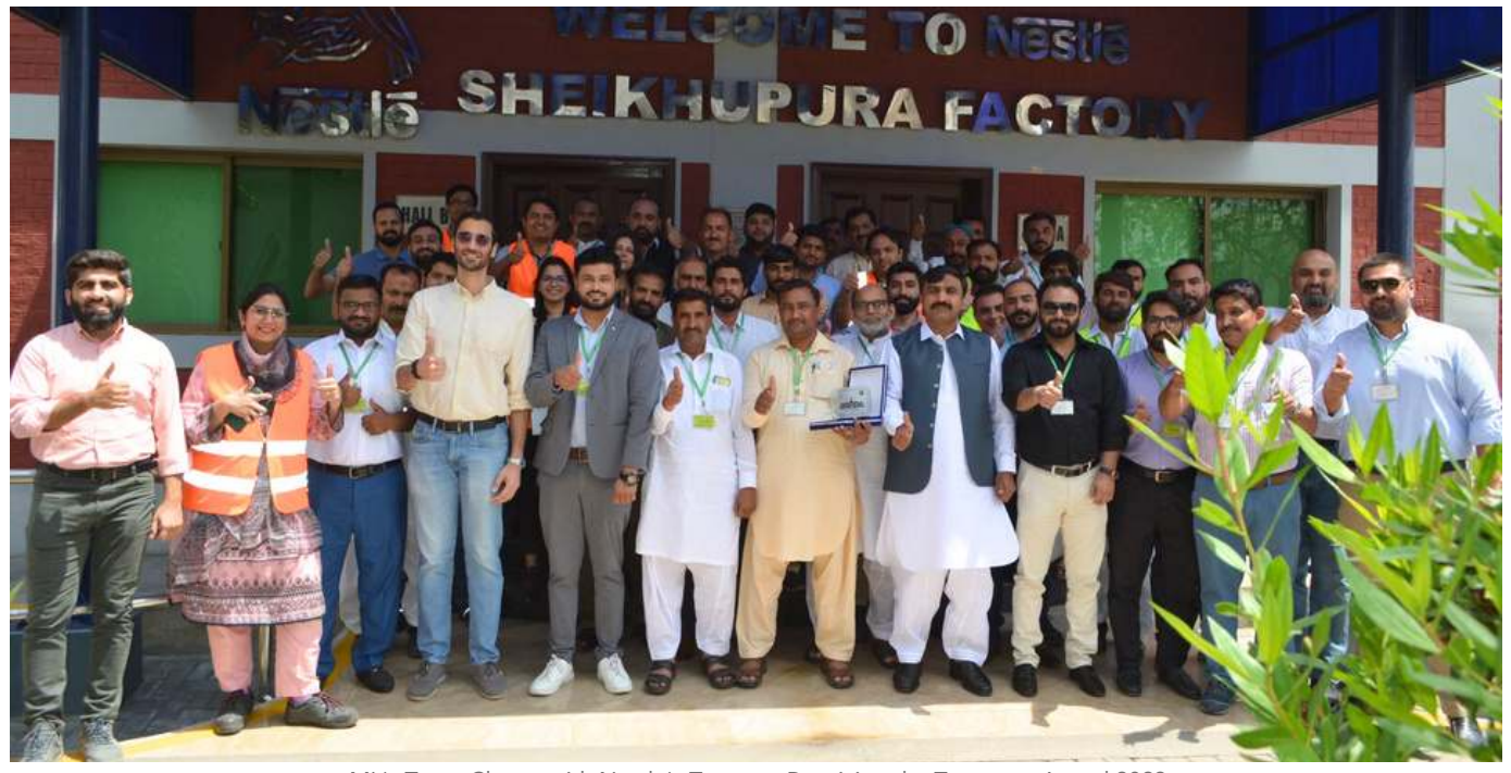
ML's Team Cheers with Nestle's Team on Receiving the Transport Award 2023

"This award reflects our team's dedication to excellence and safety in transportation. We extend our gratitude to Nestlé for this acknowledgment".