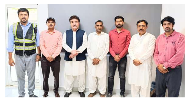
ML's Team Group Photo