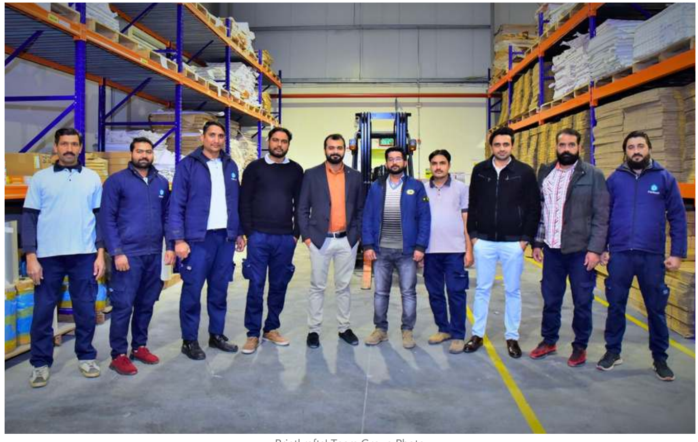
Printkrafts' Team Group Photo