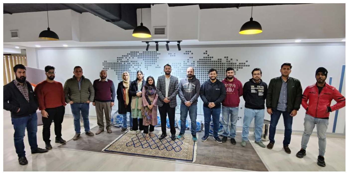
Octans' team group photo after the Objective-Setting Session

This objective-setting session marks a crucial step forward for Octans Digital, positioning the company for a future characterized by enhanced performance and a commitment to continuous improvement.