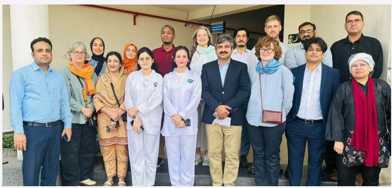
IRC Dairy's team with Danish delegation

The visit has laid a foundation for future collaboration between IRC Dairy and ARLA Foods, aimed at driving industry-leading innovation and excellence.