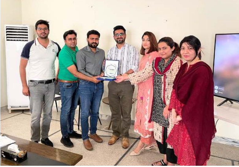
Corporate Affairs Team Wins the Teamwork Accommodation Award

The campaign led to soaring engagement, a deeper understanding of our core values, and a company culture buzzing with positive reinforcement. Employees embraced the challenges enthusiastically, leading to a more cohesive and motivated team. We look forward to continuing this momentum and enhancing our company culture even further.