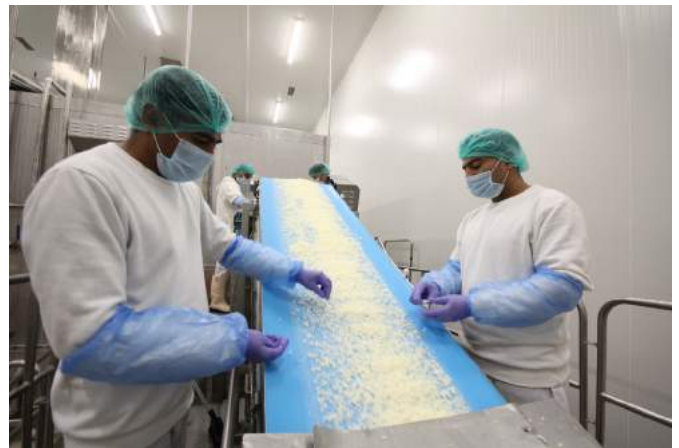
Cheese in processing

As IRC embraces this success, it serves as a reminder of our commitment to excellence and motivates us to continue striving for even greater accomplishments in the future. Let this milestone propel IRC forward with renewed vigor and determination, inspiring us to surpass our own expectations and reach new heights of success.