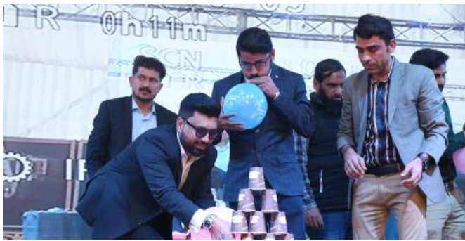
ML team participating in fun activity

Momentum Logistics recently hosted its highly anticipated Annual Event 2023 at the Khanewal Fleet yard, marking a grand celebration of achievements. Esteemed guests from Interloop Holdings, valued suppliers, vendors, and 300 dedicated employees from offices across Pakistan gathered for an unforgettable evening. The event was a joyous affair, reflecting on the accomplishments of 2023. Engaging segments were meticulously planned to ensure an unforgettable experience for all attendees. A highlight of the evening was the Employee Achievement Awards, honoring the outstanding contributions of team members.