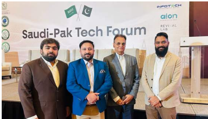
Group Photo of Octans team at Saudi-Pak Tech Forum

The Octans Team participated in the Pakistan IT Industry Association (P@SHA) Saudi-Pak Tech event in Riyadh, Saudi Arabia. The event provided an excellent platform for engaging panel discussions, valuable networking opportunities, and informative technology briefings.