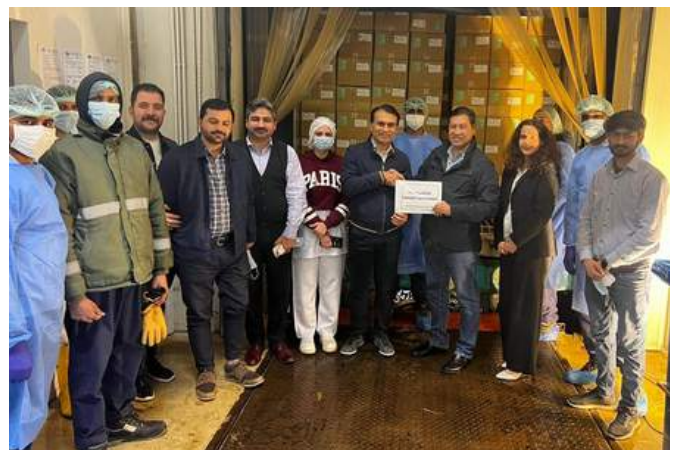
IRC team celebrating the success

IRC Dairy Products Pvt Ltd proudly announces a historic milestone for Pakistan's dairy industry: the inaugural shipment of cheese from our country. This groundbreaking achievement signifies an advancement and highlights our burgeoning presence in the global market.