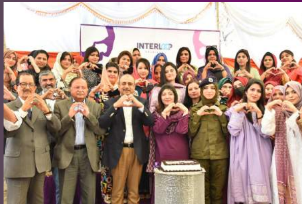
Group photo of the team

The event showcased Interloop's commitment to diversity and inclusion, fostering a workplace where everyone feels valued and empowered. Let's continue this momentum towards a more inclusive future.