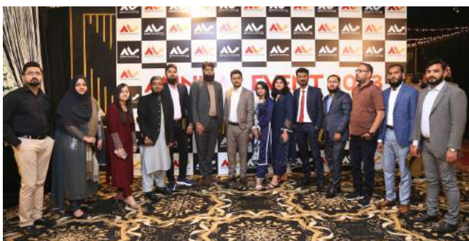
Group photo of Momentum Logistics team