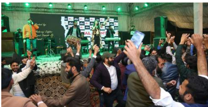
Everyone enjoying the music evening